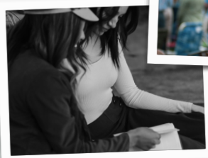
At Manheim BIC we strive to initiate and nurture a growing relationship with Christ.